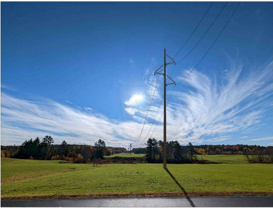
Wingood Road. Present and Planned. Not shown is vegetation clearances.